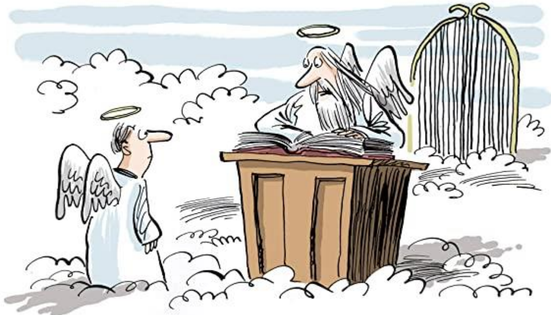
"WHICH COUNTRIES HAVE YOU VISITED RECENTLY?"

Current monthly council minutes and reports are available outside the office.